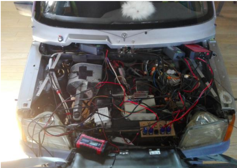
ELECTRONICS, SOUND AND LIGHT ON BOARD